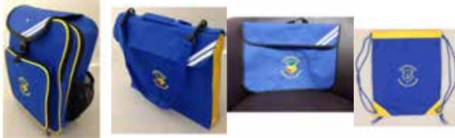
School satchel - School Book Bag - large or small - School PE Bag