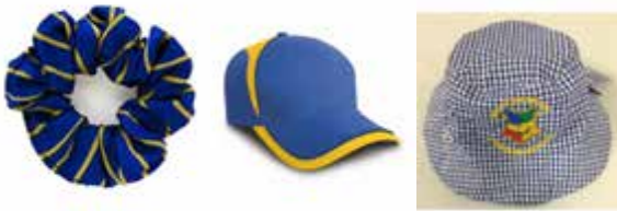
School scrunchie - School cap - Summer hat