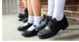
Blue and white checked summer dress - Black shoes (no open toes, boots or trainers)