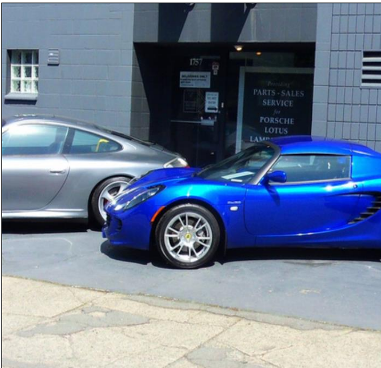
A silver car and a blue car.

In 2017, black was the most popular colour of new cars purchased according to the Society of Motor Manufacturers and Traders. More than half a million black cars, 1 in 5 of all new sales, were sold last year. White was the most popular colour in 2016, but is now in third place, with grey in second.