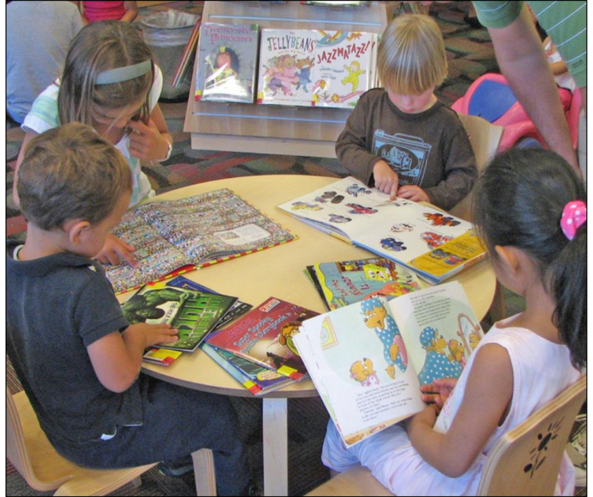
Pictured: Children reading their own books.

Do you think this is replacing the role of adults? Let us know!